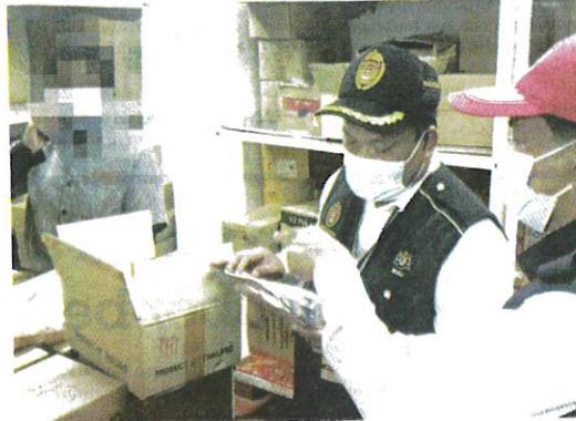
PIHAK berkuasa membuat pemeriksaan di sebuah restoran makanan segera di Kemaman semalam.

Sehubungan itu, pengurusan restoran makanan segera berkenaan telah diarahkan un-