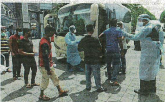
Safety first: Healthcare workers overseeing a screening test in Kampung Baru in 2020.

The ministry's 2022 Annual Report said as at Dec 31, 2021, 93.1% or 256,147 of the 274,987 positions